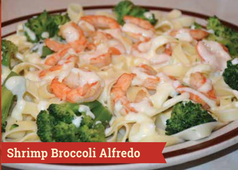
Shrimp Broccoli Alfredo

Served with soup or salad, garlic bread, bread basket and dessert.