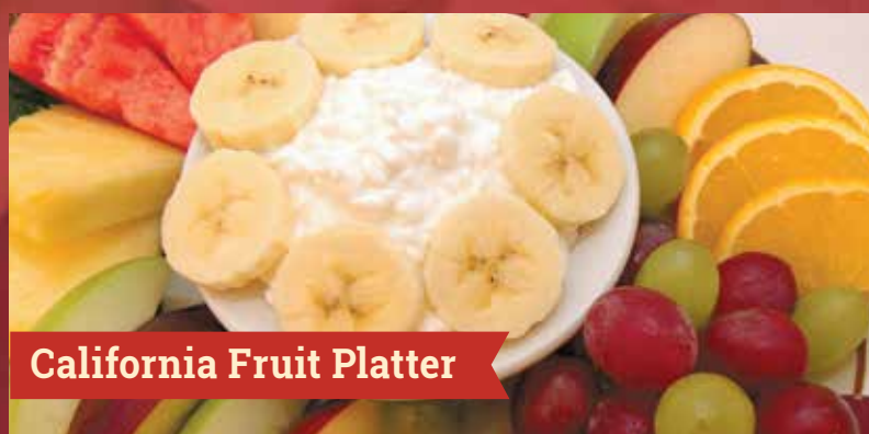
California Fruit Platter

(Does not include soup, salad or dessert)