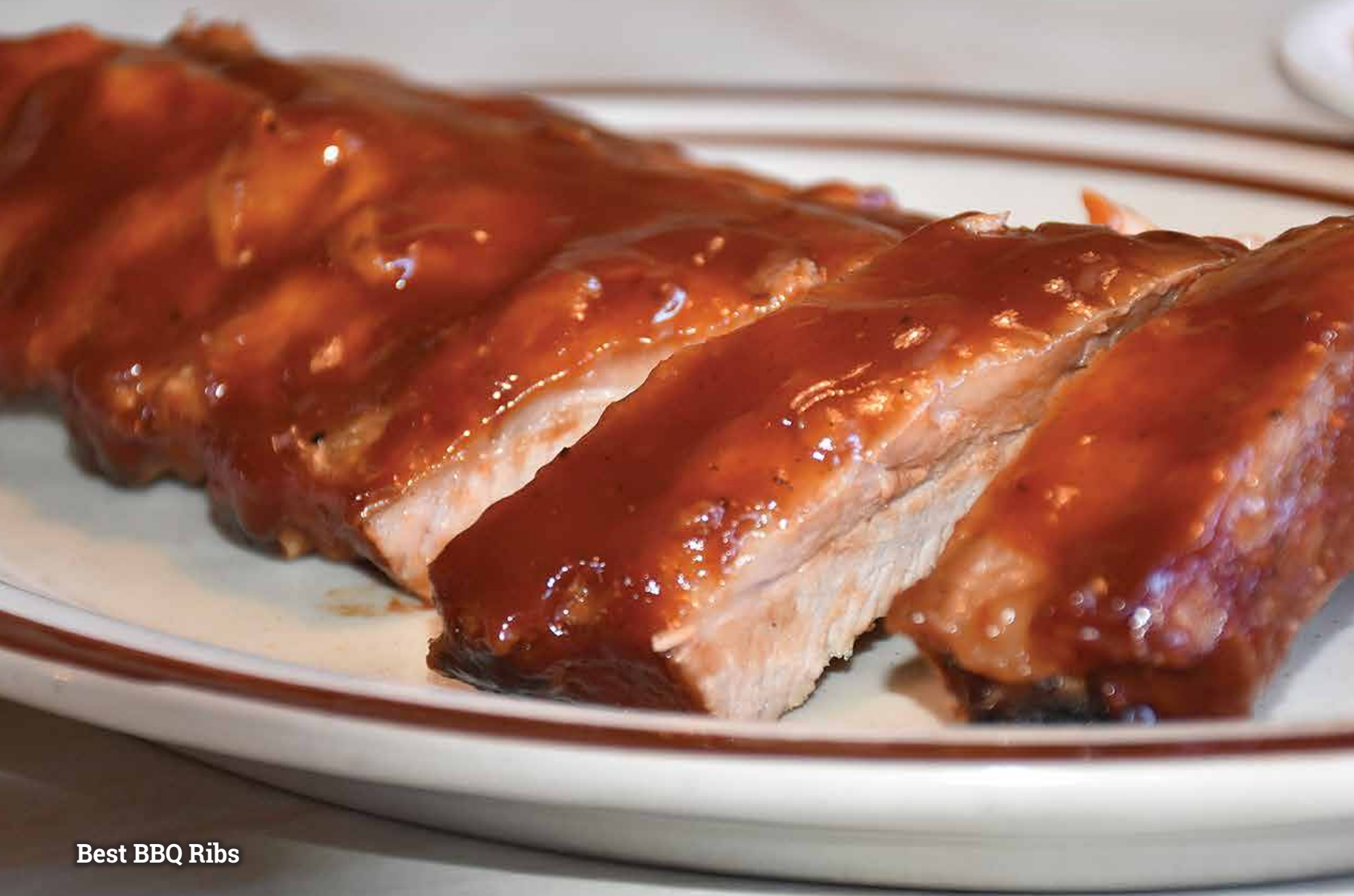
Best BBQ Ribs