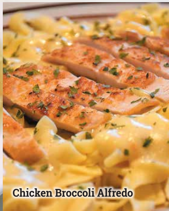
Chicken Broccoli Alfredo