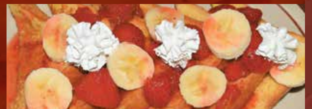
Strawberry Banana French Toast

Three pieces of French toast. Topped with whipped cream $14