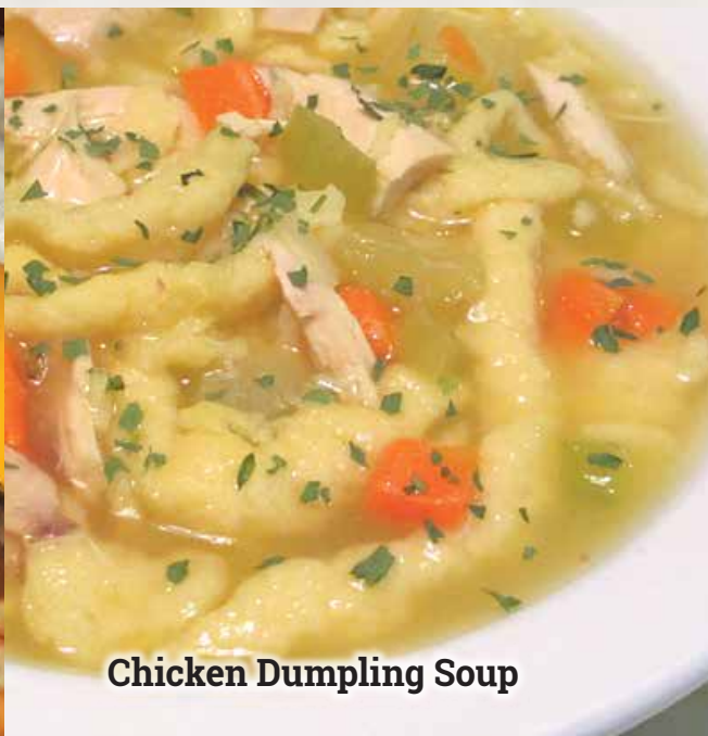
Chicken Dumpling Soup