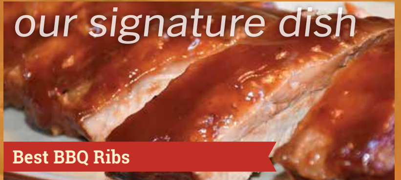
Best BBQ Ribs