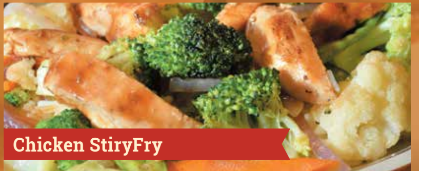
Chicken Stir Fry

(GF) Gluten Friendly (excludes french fries and bread basket)