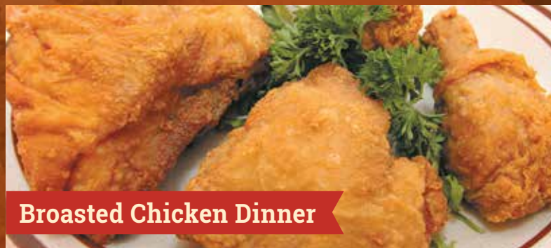
Broasted Chicken Dinner

Grecian Chicken Breast (GF) Grilled with fresh oregano and lemon juice $16