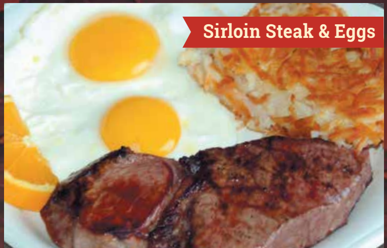
Sirloin Steak & Eggs